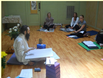
Ayurveda class for Yoga teachers.